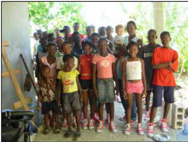
These are members of Youth for the Development of Cyvadier. Several of them are wearing No Sweat red sneakers (union made in Indonesia), which Global Village donated. To learn more about this project in Cyvadier, visit www.konpay.org

experiencing severe hunger as a result of rising food costs this year.