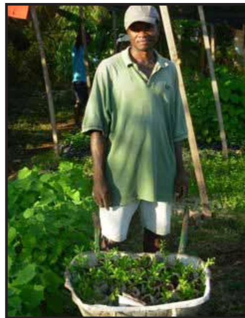
This farmer is collecting seedlings at the Cyvadier nursery funded by Global Village

trees cannot be overstated. Haitians are